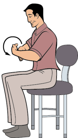
— 2 —