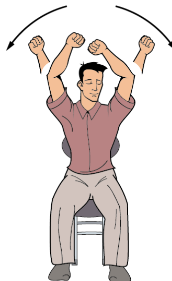
— 4 —