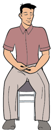
— 1 —

Place the left hand in front of your lower abdomen, palm facing the body. Raise the left hand up vertically, until it reaches a position above your head. While the left hand is ascending, the right hand rotates around it clockwise, until both hands are above the head. Use both hands to tie a knot. Repeat two more times, finishing with three knots, which fixes your attention and the Kundalini above the head.