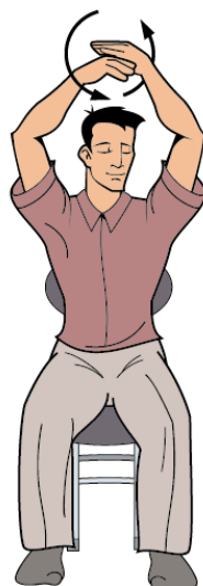
— 3 —